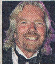
Wake-up call: Richard Branson is among those calling for more renewable energy resources

Their report, entitled The Oil Crunch - A Wake-Up Call For The UK economy , warns